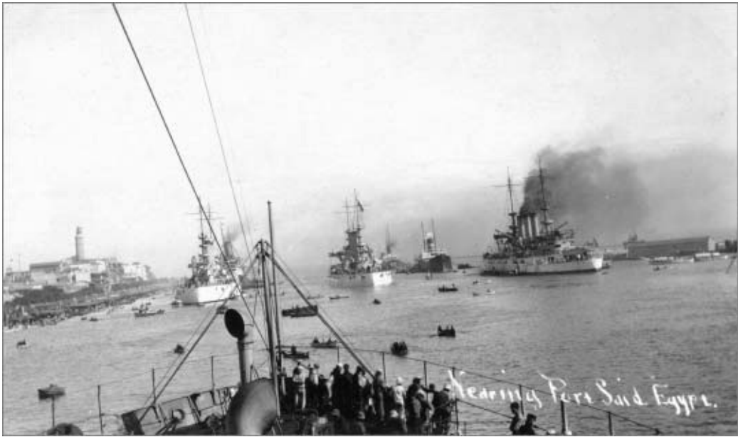
Warships of America's Great White Fleet preparing to enter the Suez Canal in January 1909.