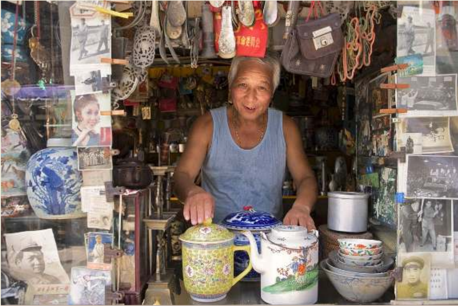
A shop owner at Dongtai Road Antique Market