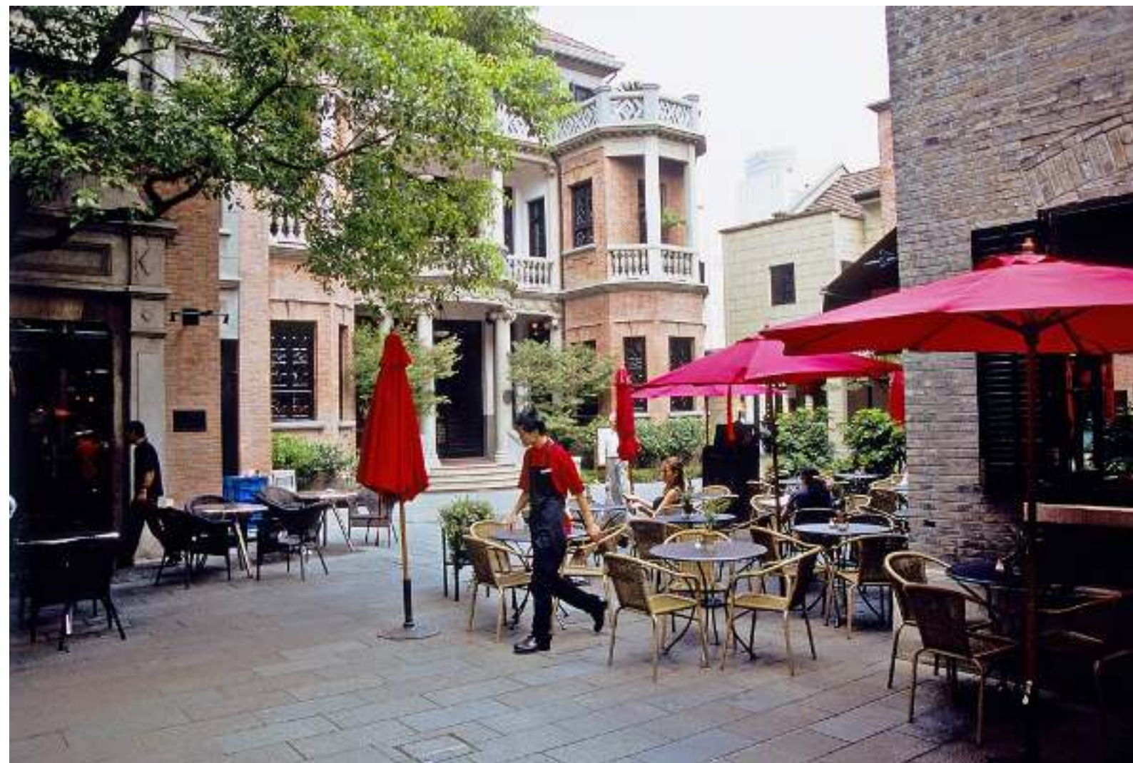
CAFE IN THE XINTIANDI AREA