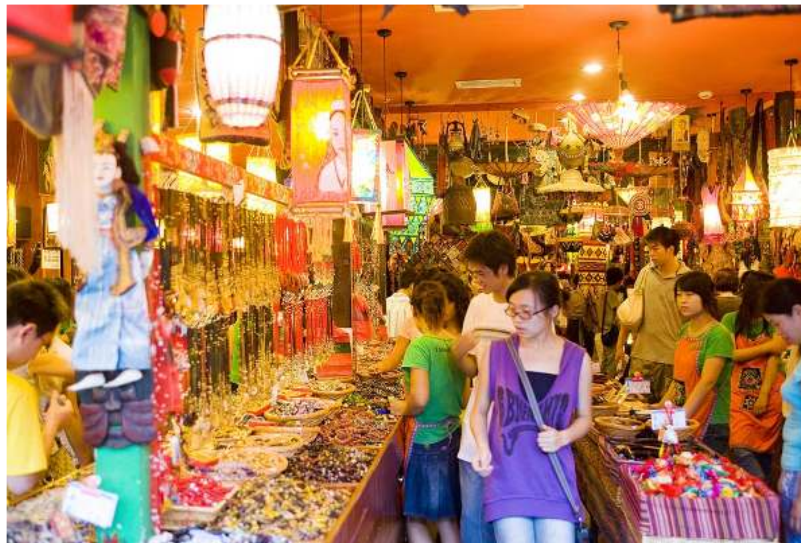
SOUVENIR SHOP IN OLD STREET