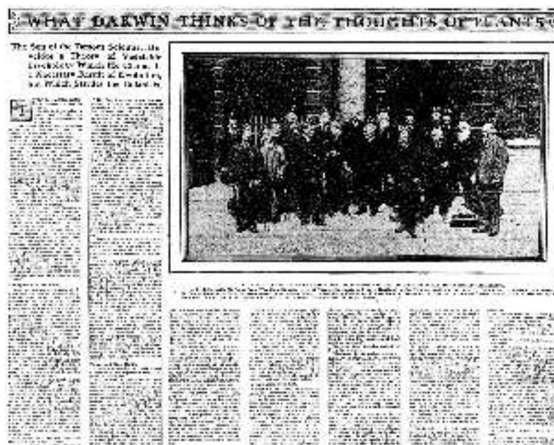
Figure 1-2. New York Times page reporting Francis Darwin's announcement at the 1908 annual meeting of the British Association for the Advancement of Science: Plants have a primitive form of intelligence.

The impact was extraordinary. The debate was reported in newspapers all over the world and divided scientists into two opposing camps. One side—persuaded by the evidence Francis Darwin offered to support his assertions—quickly affirmed the existence of plant intelligence; the other side adamantly rejected the possibility. Just like in ancient Greece!